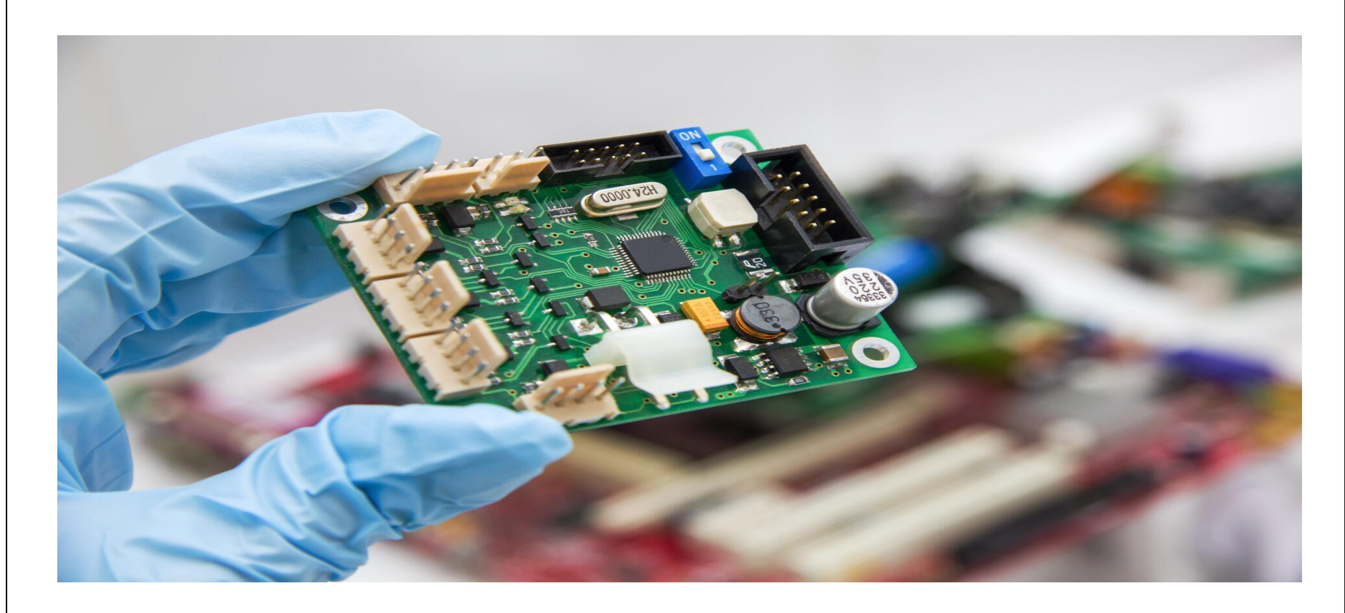
Fig 1. How a Printed Circuit Board looks like

PCBs, which stand for Printed Circuit Boards, have emerged as critical components in modern electronic devices, enabling the interconnection and functioning of complex electronic circuits. They have played a pivotal role in shaping the electronic industry, and their continuous development has facilitated the miniaturization, efficiency, and reliability of electronic devices. I will assist my Ph.D. mentor and analyze different PCBs to be constructed on a miniature camera